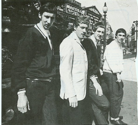
The Who in Piccadilly Circus in 1965. Although adopted by the media as a favorite band, the group were never as beloved in the real world as people like the Small Faces and the Animals.

away to come up with some suitable material before the LP could be issued. The delay was fortunate, not only because of the quality of the songs that Townshend eventually wrote for the album, but also because in the meantime the band had a huge hit with the "My Generation" 45, and were able to use its success as a selling point for the album.