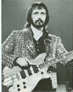
John Entwistle at Wembley Empire Pool in 1975.

tracks for the film of the same name in 1979. It didn't achieve the sales it deserved, and it's only recently that "Quadrophenia" has been greeted as the major work it undoubtedly is.